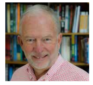
PG 3: THE RANKING DEBATE

A quarterly newsletter of the Rhodes University Development Division celebrating our corporate donors who are integral to the complete Rhodes experience.